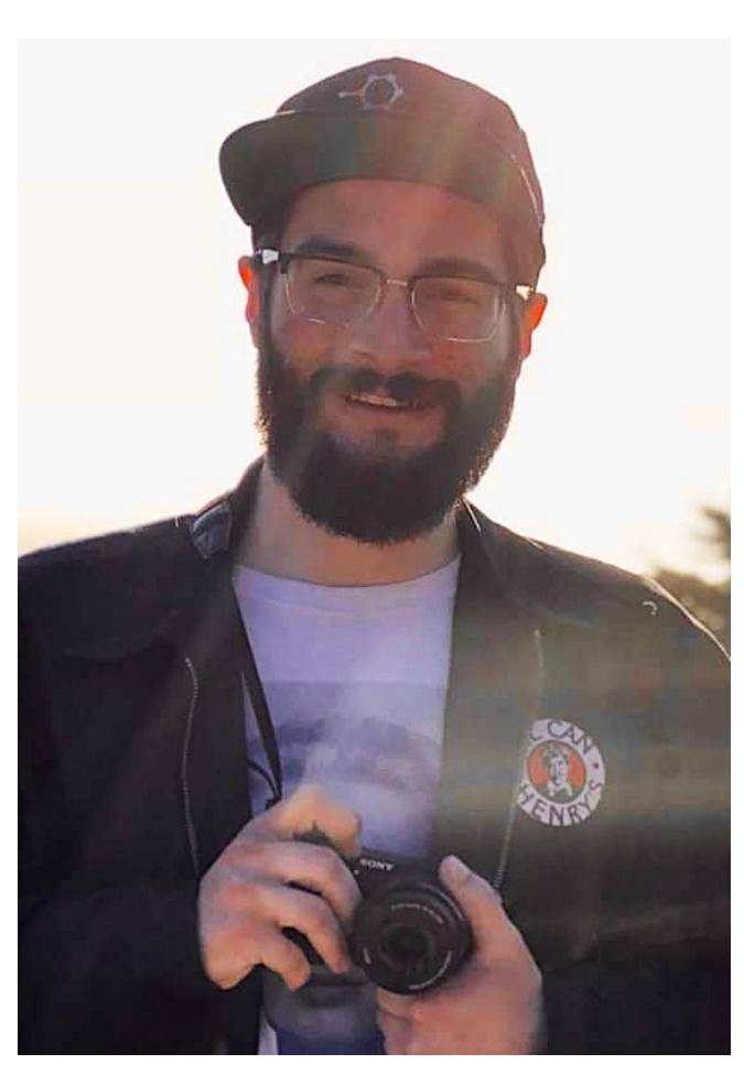
United Church of Hinesburg Hinesburg, Vermont