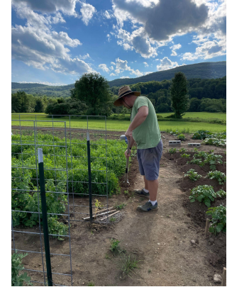
Volunteers are the heart of New Community Project.