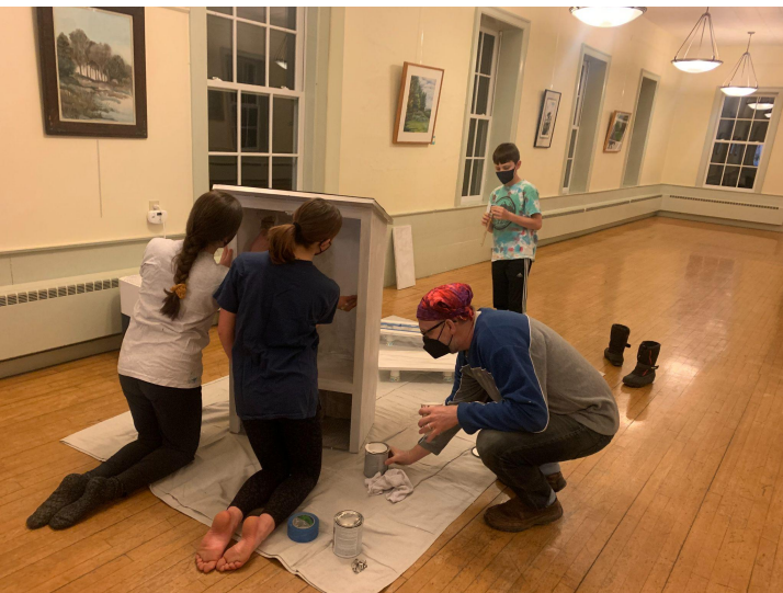
Our year began with helping the Charlotte Congregational Church Youth Group install a Little Free Pantry at their Food Shelf which is adjacent to the church.