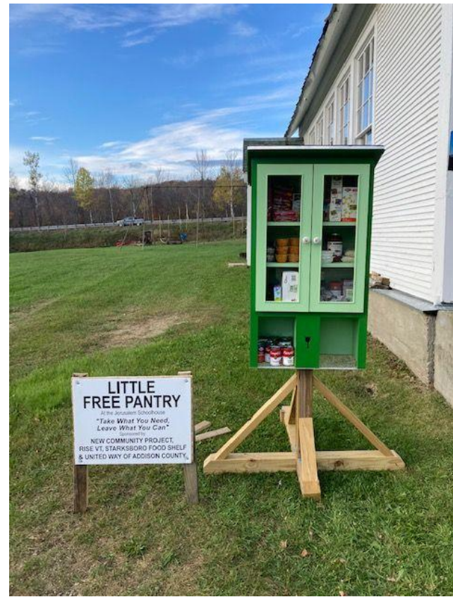
NCP's Two Little Free Pantries saw heavy use in 2022. Volunteers and staff refilled the pantries daily.