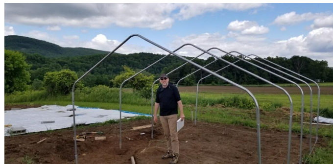
The Charlotte Congregational Church's Men's Group helped build a 12' x16' greenhouse for NCP